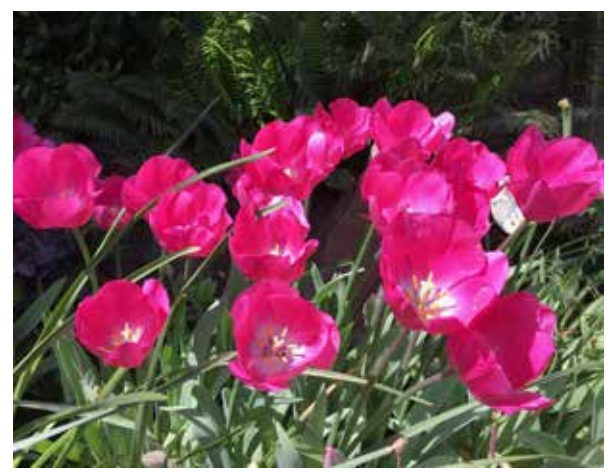
Traveling often involves stopping and smelling the flowers. Placing a photo like these colorful poppies enjoyed on a trip to Big Sur recently can help activate the Travel, Helpful People and Heaven Bagua area.

The Travel, Helpful People and Heaven area of the feng shui Bagua is located along the front entrance door wall, on the near wall as you look into the space. This is often overlooked area, which is relevant for a healthy life area of the Bagua map, is governed by the metal element, which can be activated with colors like white, silver, grey and metallic, or inspirational, helpful or grateful sculptures made of bronze, like of Ghandi, Buddha or Arch Angel Michael. Place a photo gallery of your family or friends who are also helpful to you in this area, but avoid placing any reminders of people here who made your life difficult. Place symbols of who and what you feel gives you a sense of deep gratitude. ... continued on page D10